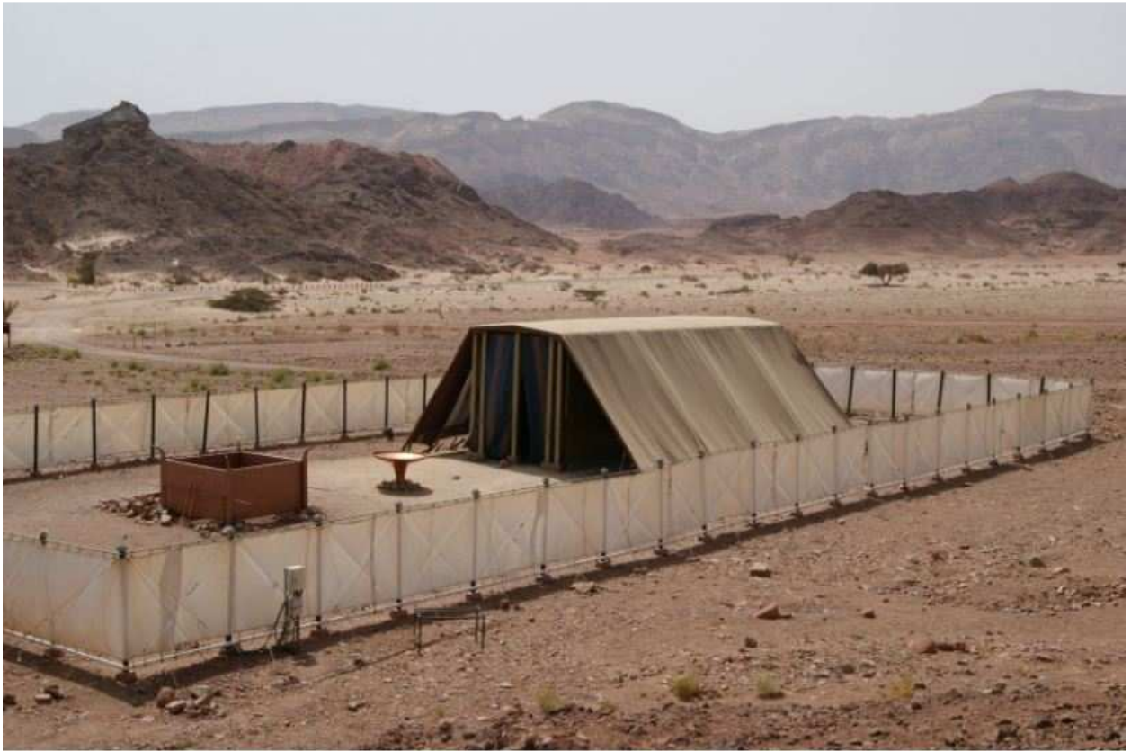
Replica of the tabernacle in the wilderness.