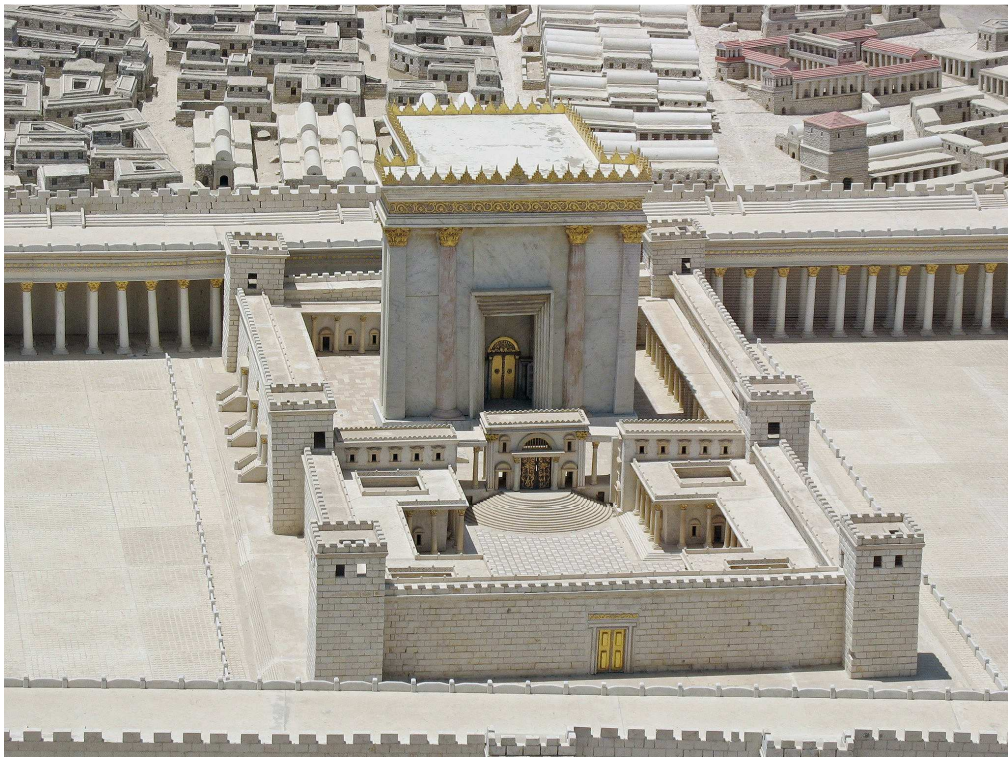
Model of Herod's Temple in the Israel Museum